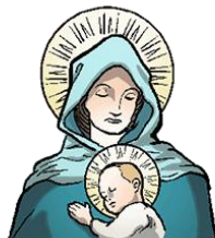
Solemnity of Mary

The Solemnity of Mary is also called the Octave of Christmas. An octave marks eight days after the significant Christian events of Christmas and Easter. These holidays are celebrated for a week, with the octave marking the last day.