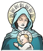
Solemnity of Mary

The Solemnity of Mary is also called the Octave of Christmas. An octave marks eight days after the significant Christian events of Christmas and Easter. These holidays are celebrated for a week, with the octave marking the last day.