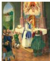
Painting of the Miracle of Seefeld, preserved in the Elbethenkapelle ad Hopfgarten

There were many witnesses who saw the miracle, and very soon the news spread throughout the whole nation. The Emperor Maximilian I himself was very devoted to it. Today one can visit the Church of St. Oswald where the precious relic of the Host, stained with blood, is exposed, and also view many paintings of the miracle.