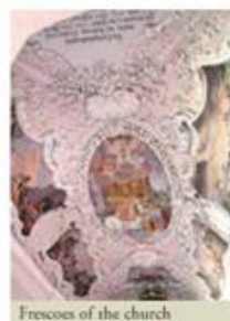
Frescoes of the church