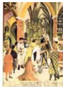
Ancient painting of the miracle